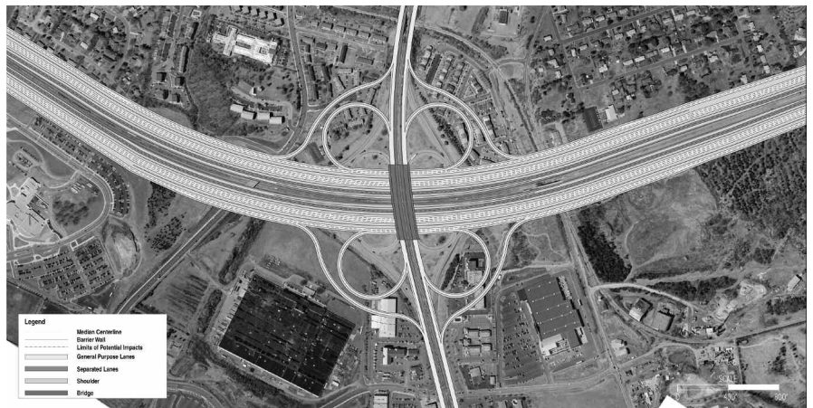
Proposed 20-Lane Highway Interchange from VDOT Draft Environmental Impact Statement, page 5-3, released November, 2005

Did you know that the Virginia Department of Transportation (VDOT) plans to: