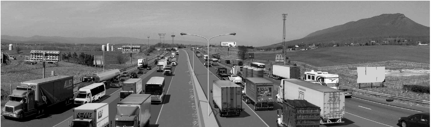
Simulation of I-81 expanded to 8 lanes through New Market, as proposed in VDOT study.